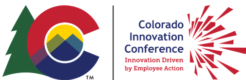
The Colorado Innovation Conference, running from May 2, 2023, through May 4, 2023, aims to inspire and increase State employees' ability and willingness to share and try bold new ways of doing their work.

-The Wing will celebrate the 100th anniversary of aviation in Colorado by hosting a family day for its members May 7, from 9 a.m. to 2 p.m. at Buckley SFB.